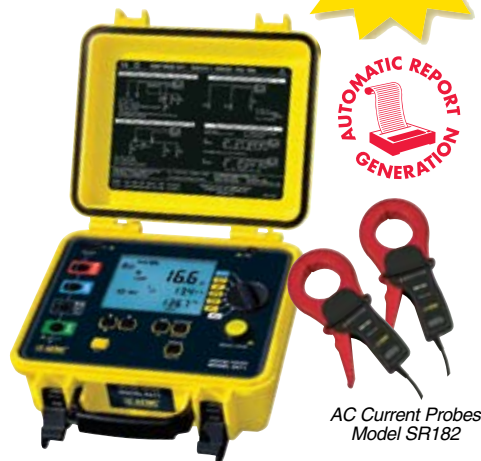
AC Current Probes Model SR182