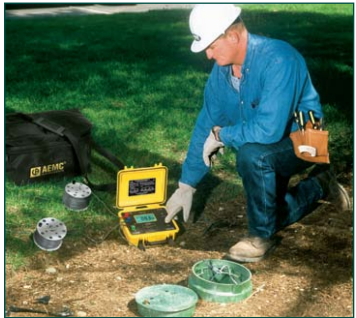
Model 4630 performing a 3-Point ground resistance test on an individual rod.