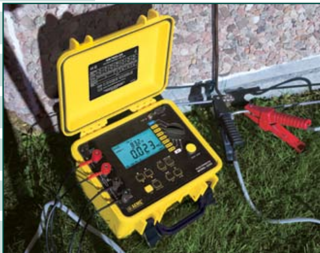
Model 6250 conducting bond verification on a grounding system.